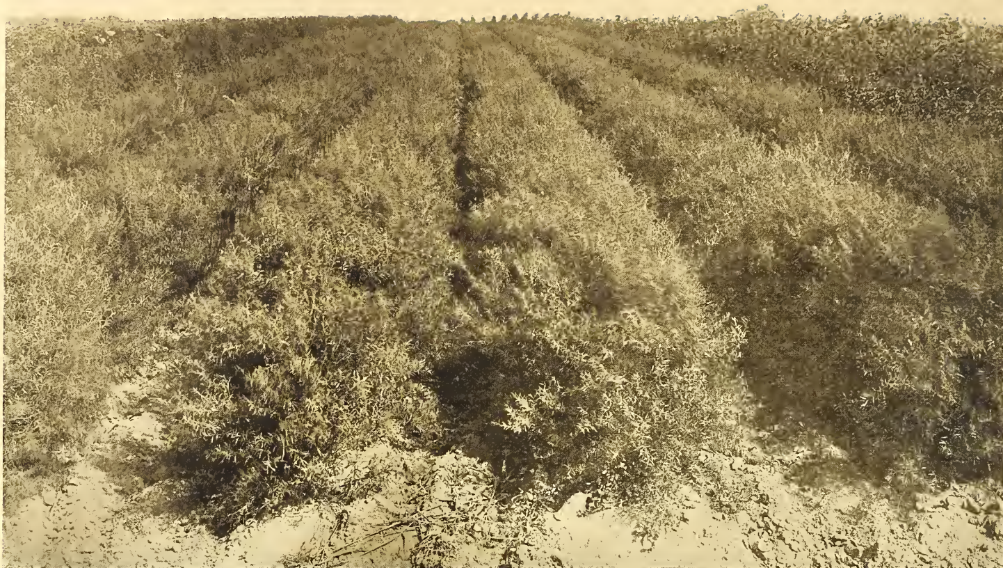
Our Spirea Thunbergii: Two Years